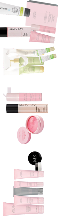
TIME WISE MIRACLE 3D $158 VALUE