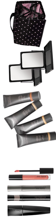
LASH & LIP $144 VALUE